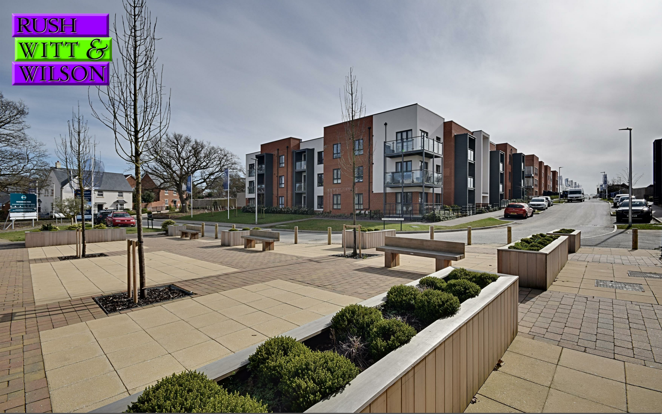
5 Brooklands House Brooklands Road, Bexhill-On-Sea, East Sussex TN39 4FR £189,950